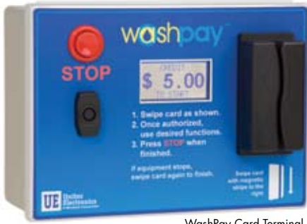
WashPay Card Terminal