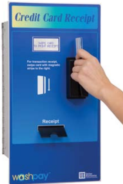
WashPay Receipt Printer

The WashPay Site Management System consists of card terminals, a central site controller and a networking kit. Optional components include a customer receipt printer, credit dial appliance (not required for Internet credit card processing) and a User Interface Kit for the site controller.