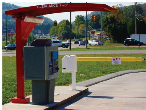
Sentinel utilizing a gate barrier with the Lane Control System