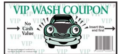
Style F – Qty: _____ green ink – viewable on sales sheet