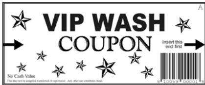
Style A – Qty: _____