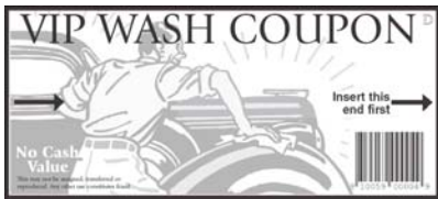
Style D – Qty: _____