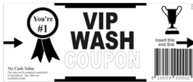
Style B – Qty: _____