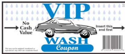
Style E – Qty: _____ blue ink – viewable on sales sheet